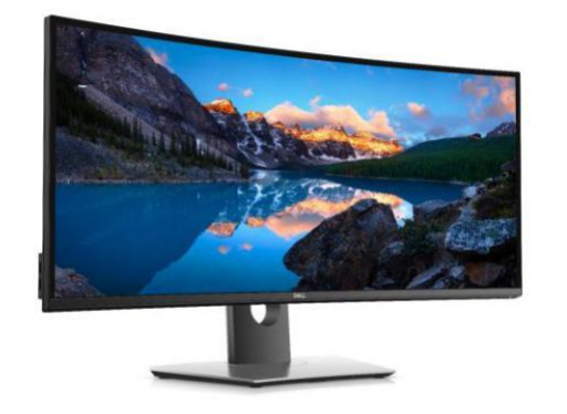
Up to $2 for every display purchase