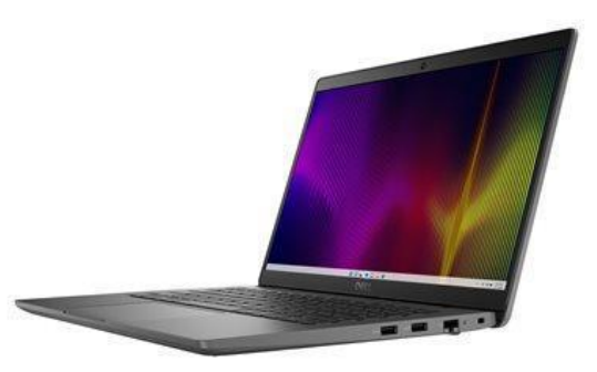
Up to $30 for every laptop or PC purchase

The RISE Incentive Program offers generous core $ per box values when you purchase eligible products from Dell Technologies Authorized Distributors.